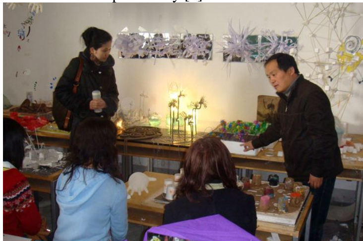
Fig. 3 Teachers should pay attention to the cultivation of humanity in teaching

With the development of social economy, humanized design and green development have become the theme of visual communication design. The visual communication design professional must assume its social responsibility, pay attention to the protection of natural life and full use of resources, and take people as the center. This visual communication design professional teaching will be more green science, in line with the requirements of environmental protection and ecological development. This is the requirement of human-oriented green design in the visual communication design profession, and it is also a concrete embodiment of its commitment to social responsibility. Through the integration of humanistic design concepts in the visual communication design profession, the unity of graphic design and ecological environment has been achieved, which is conducive to cultivating students' sense of social responsibility [7].