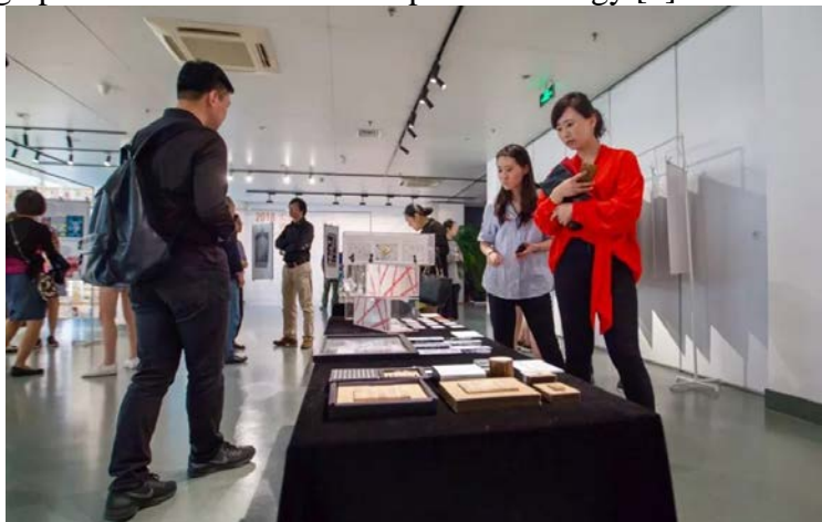
Fig. 2 School organization student works exhibition practice

Visual communication design institutes shall organize charitable activities, and encourage students to actively participate in public welfare undertakings organized by society and schools. Through the development of students' expertise, they will practice socialist core values in artistic creation and artistic communication, and assume their own social responsibilities. Of course, teachers can also increase the content of social practice in the teaching process, give students a topic, and allow students to create in practice. In this way, not only can we train students to shape their practical ability, but they can also develop their sense of social responsibility and promote the cultivation and cultivation of socialist core values so that students can truly appreciate the artistic value of the visual communication design profession and exert their positive energy [6].